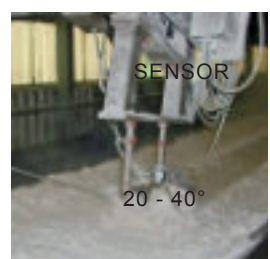
Coal & coke iron ore Aluminium oxide