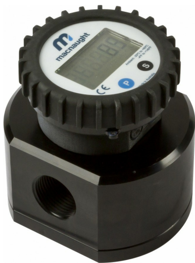
PRA Digital Register