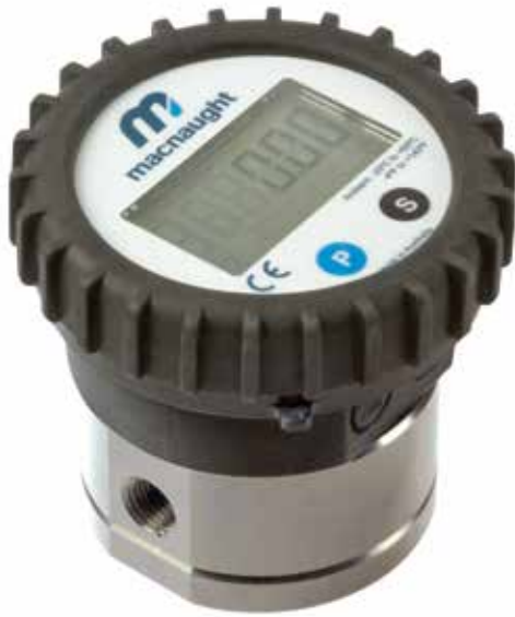
MX06P-1SE Stainless steel body with LCD register